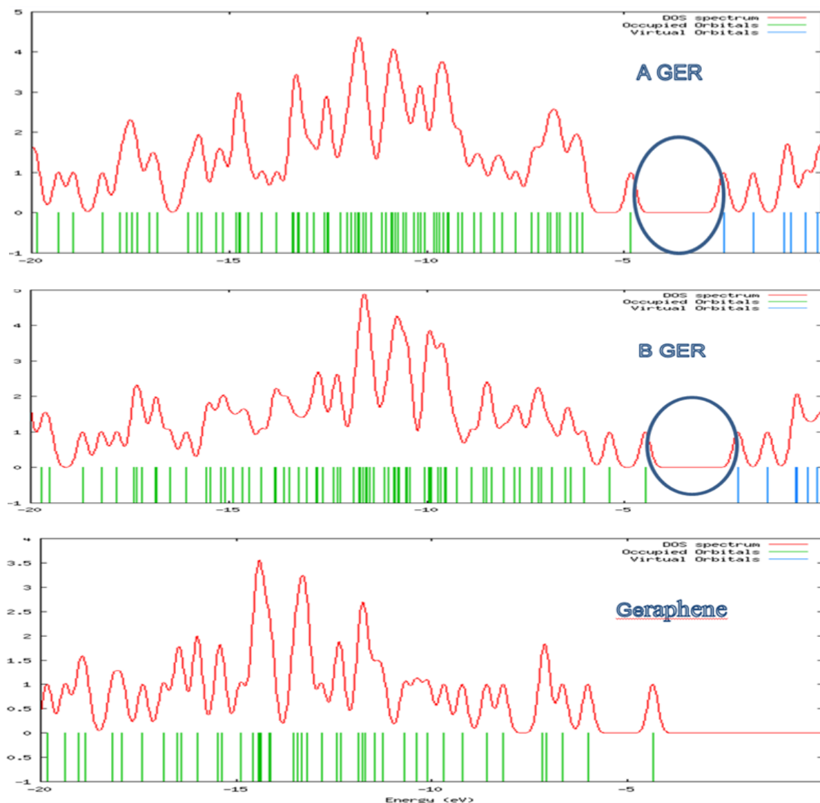
Fig. 2. Displays the trend of the HOMO/LUMO changes in the various charts.

The results show that the attachment of Glutamine structure to the structure of Graphene reduces the total energy level. The values of Entropy also show that the attachment of Glutamine structure to the structure of B GER increases the amount of disorder and chaos and consequently the value of Entropy. The values of dipole moment also show interesting results. B GER shows greater dipole moment value in comparison to other forms. In other forms, in comparison to form in which Glutamine is not attached to Grapheme, the attachment of Glutamine to Graphene from A GER position does not change the value of dipole moment so much.